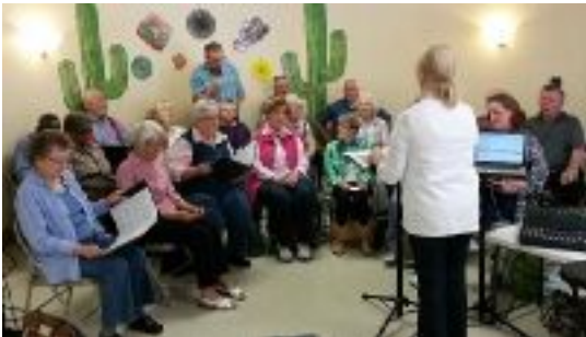
50+ Choir performs