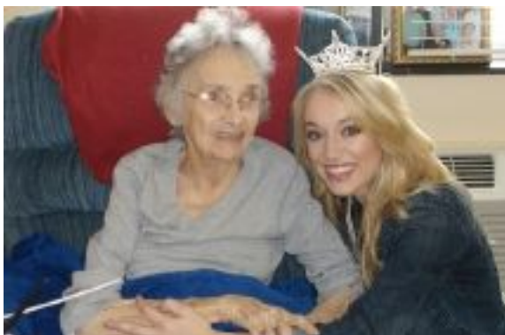
Thank You Miss Virginia