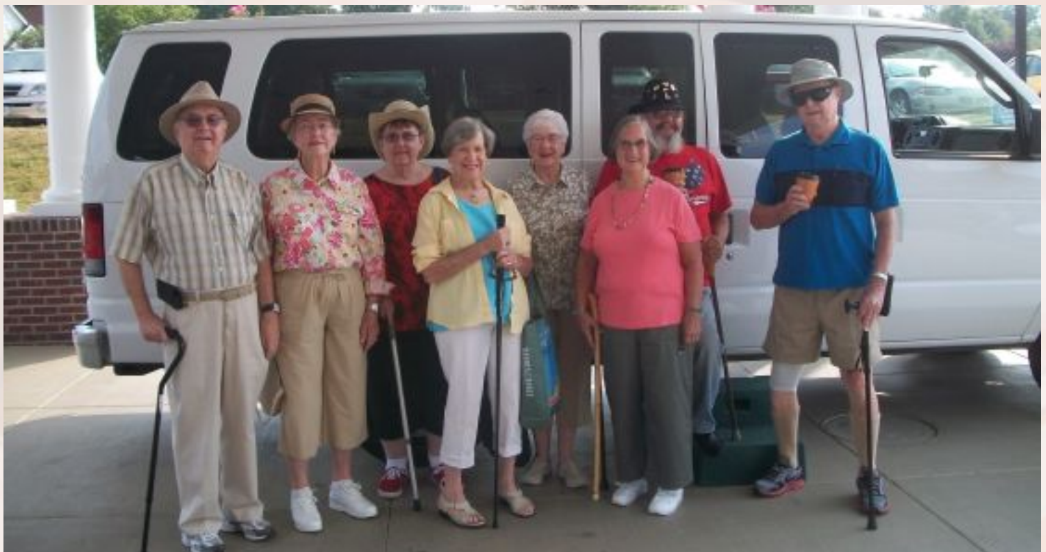
On the road again ... The Courts residents are posing in front of the new van for activity adventures.