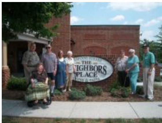
Bon Appetit Club members

The Bon Appetit Club recently ventured to The Neighbors Place in the Wyndhurst community of Lynchburg. Members of the club enjoyed a fantastic meal and as always lots of laughs.