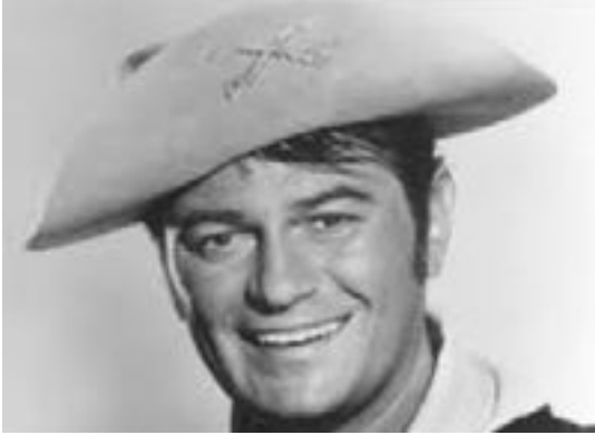
Larry Storch as Corporal Agarn