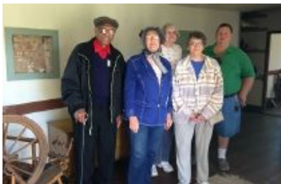
The Courts & Brookview residents visited Sailors Creek!