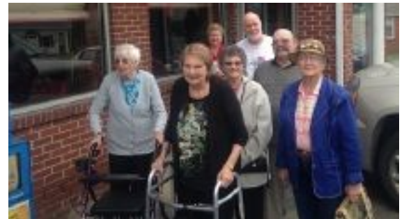
Have you ever tried The Cumberland Restaurant? The residents believe it has very good home-like food, and nestled in a small town.