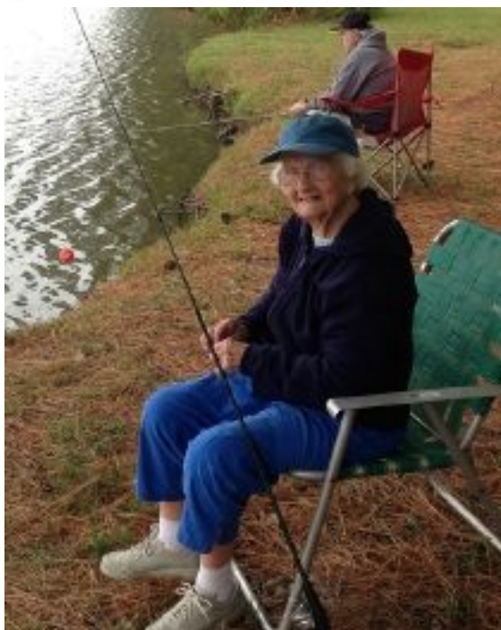
Fishing Club enjoying a relaxing afternoon.