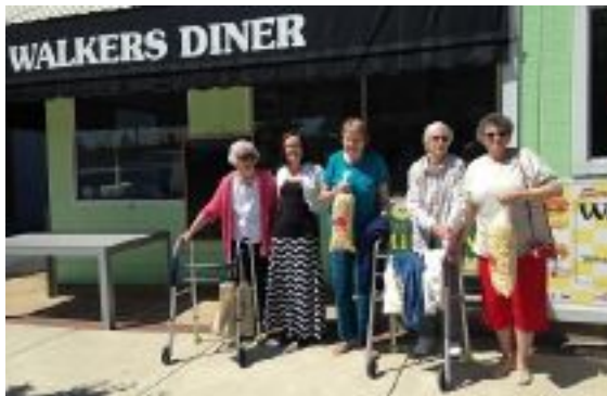
The newly renovated Walkers Diner was enjoyed by the Assist Living residents from our Brookview facility.

Spread some cheer. Visit a neighbor or our retirement home for a friendly chat with the residents. It's usually much harder for these folks to leave their home during the winter, so bring a cabin fever cure to them.