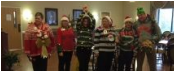
Ugly Sweater Contest

The month of December was filled with activities for staff to enjoy. Eating and participating in craft items and also giving back to the community with a toy and food drive.