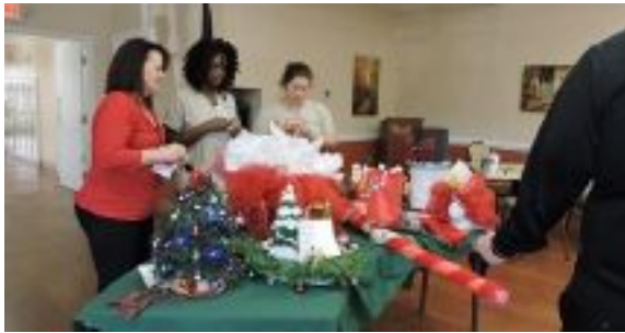
Crazy Hat Contest

Thanks to all those employees who joined in on the holiday events!