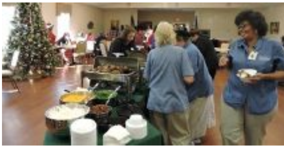
Potato/Chili Bar for the staff's enjoyment...