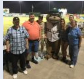
Hillcats Baseball time!