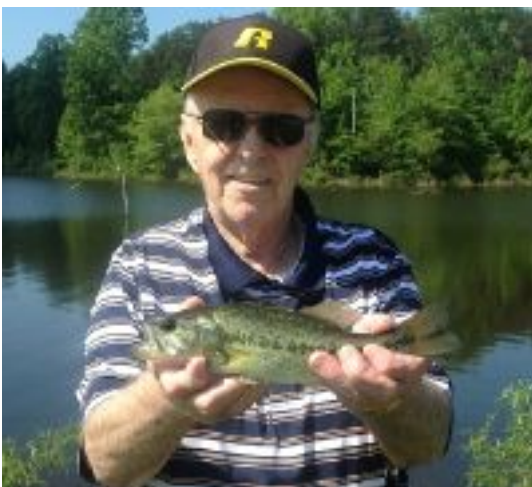
Once the picture was taken, the fish jumped right out of the bucket back into the pond!