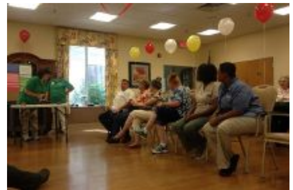
Family Feud was played during NALW