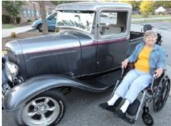
Car Show at The Woodland

Soon, holiday tunes will fill the air. If you get the chance, join in a sing-along. Singing in a group is good for you. Crooning in a chorus lowers your stress, elevates your mood and can even benefit your heart rate as much as yoga does.