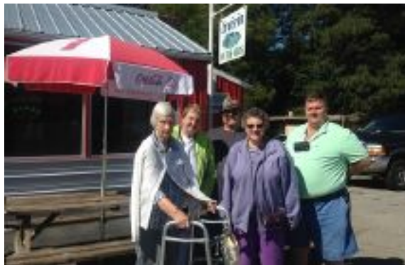
B.I.G. catch of the day