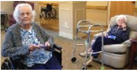
Playing cribbage at Brookview