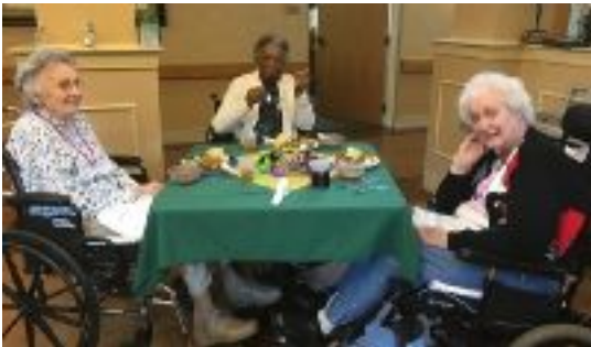
Watson residents enjoy an afternoon party.