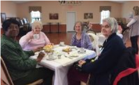
The Courts residents enjoy their tea party.