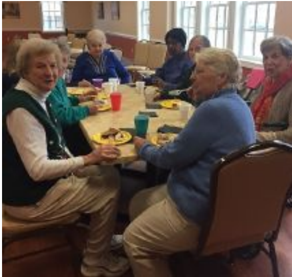
Pie enjoyed by The Courts residents.