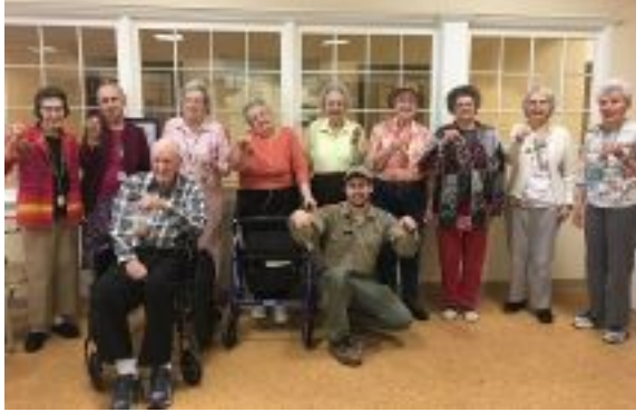
A representative from Twin Lakes State Park came out to show residents of Brookview how to make bird feeders.