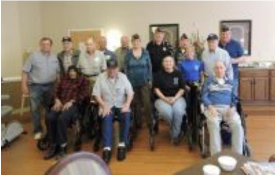
The local VFW came out to visit with some of our resident veterans.