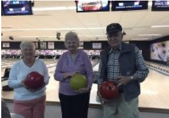
Bowling at the local bowling alley in Farmville.