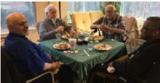
The men of Brookview enjoyed KFC in the sunroom.