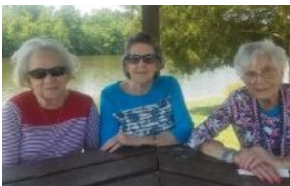
Wilkes' Lake visit