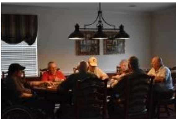
Poker at Brookview